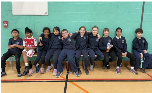
The second festival...